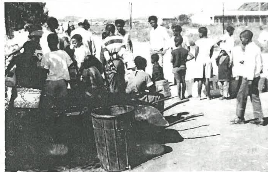
Daily scene for 12 days: waiting for water to come through near the schools.